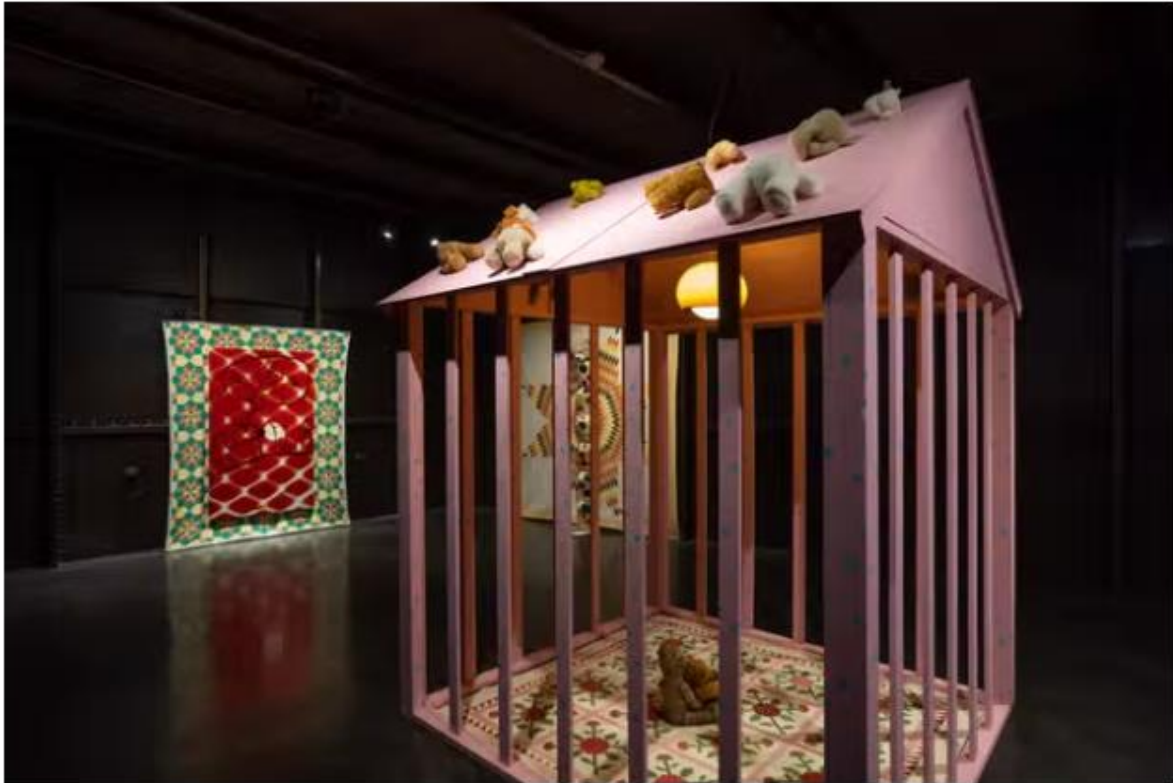
Installation view: Hadi Fallahpisheh: As Free As Birds at Goldsmiths Centre for Contemporary Art.

This first institutional solo exhibition in Europe for Hadi Fallahpisheh is now enjoying an extension. Meaning, that if you'd meant to get down to Goldsmiths CCA to see the Iranian artist's work, there is still time.