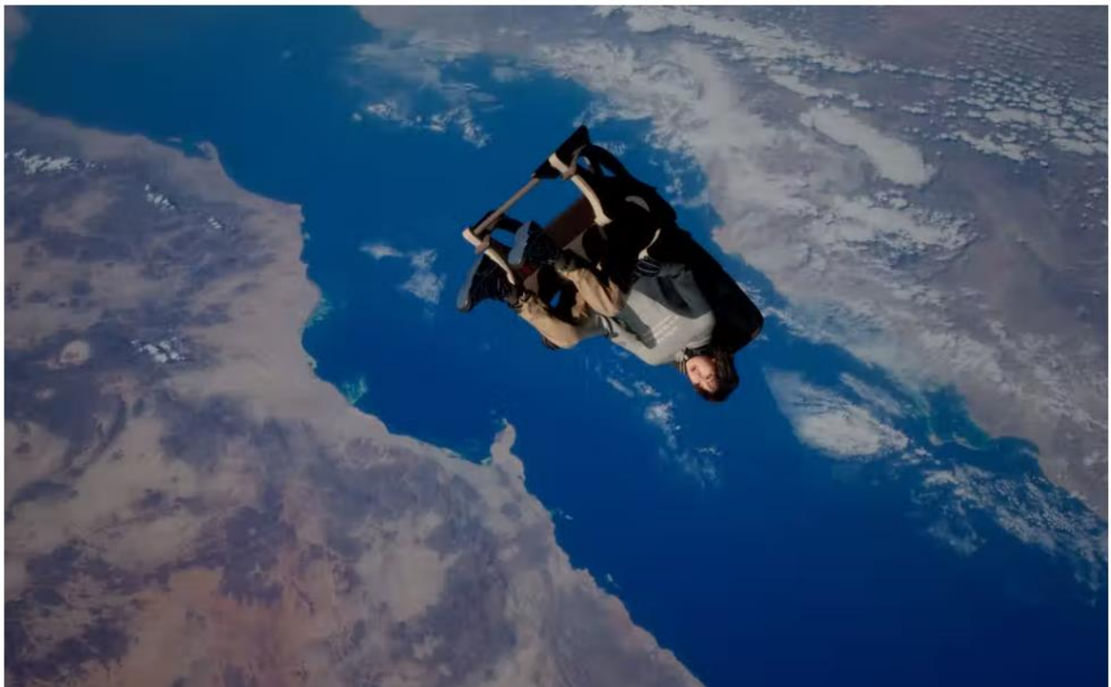
LuYang NetiNeti – DOKU – Binary conflicts invert illusions 9

By Elizabeth Gregory | 20 September 2022