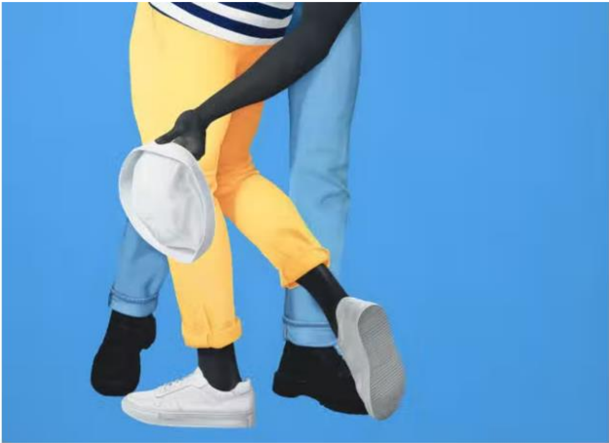
Amy Sherald, For love, and for country, 2022

Opening in a month, but nevertheless worth making a note of now, US artist Amy Sherald will be sharing an entirely new body of work at this upcoming show. The portraitist has become one of America's most famous: she's best known for painting Black Americans at leisure and will continue to investigate the Black experience in this London exhibition.