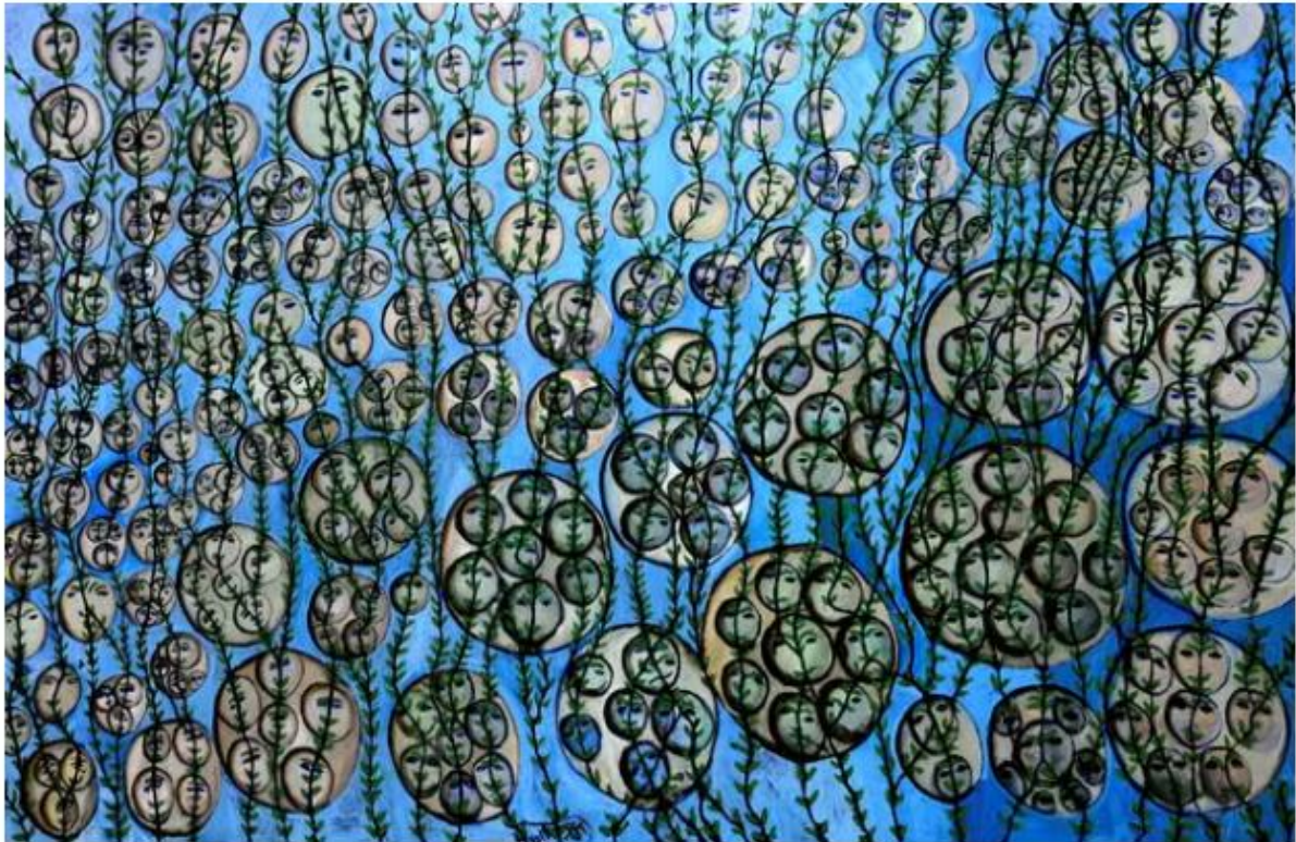
Blues for the Martyrs, 2022. Courtesy the artist.